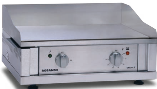
Extreme Performance (XP) G500XP (8 mm plate) 3450W, 15 Amp