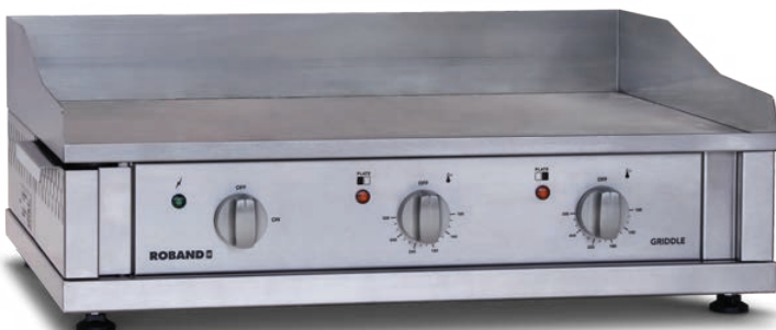
G700 (8 mm plate) 4240W, 18.4 Amp